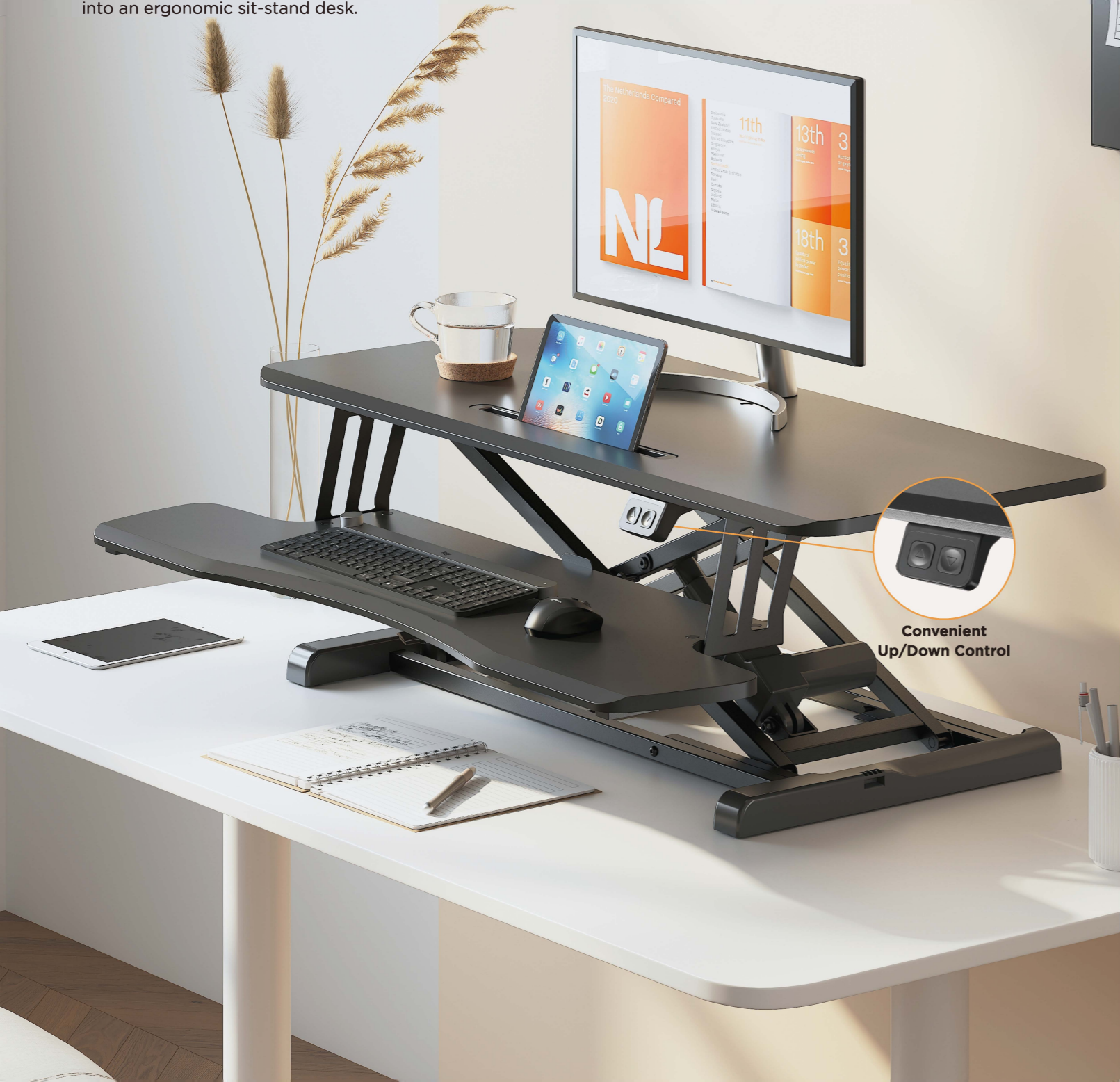
Convenient Up/Down Control

There is no better choice than the EDT-S15 Series when it comes to effortless transition between sitting and standing - with only a touch of the button. It can be placed on any worksurface, turning your normal desk into an ergonomic sit-stand desk.