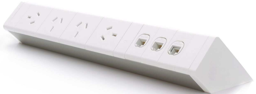
A04R0310DWT Shown (Data jacks not included)